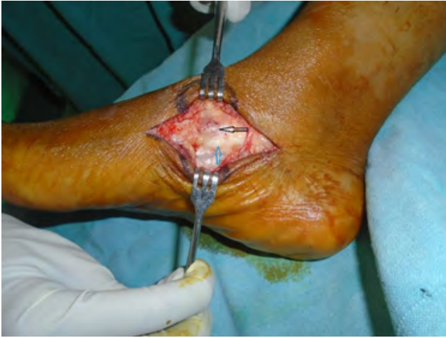
Figure 3: Intra operative image showing the ganglion cyst (Black arrow) lying deeper to the tendon of tibialis posterior (Blue arrow)