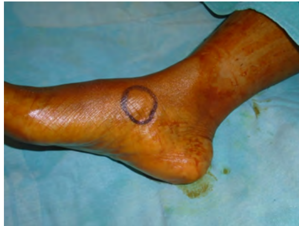
Figure 1: Focal area of pain over the medial arch of foot

Axial PDFS (a) and T2 (b) images of the ankle show a well defined high signal lesion (blue arrows) at the medial aspect of the naviculum anterior to the posterior tibial tendon attachment site. Navicular bone (blue block arrows) is normal