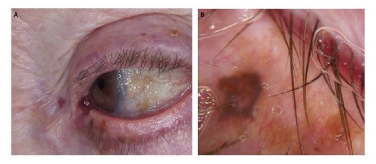
Figure 1: Clinical and dermatoscopic aspect of the blu lesion of the left lower eyelid margin.