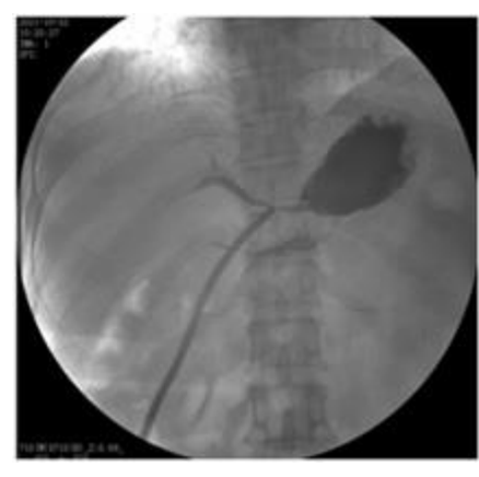
Figure 3: T-tube angiography showed left hepatic duct merged into the lesser curvature of the stomach.