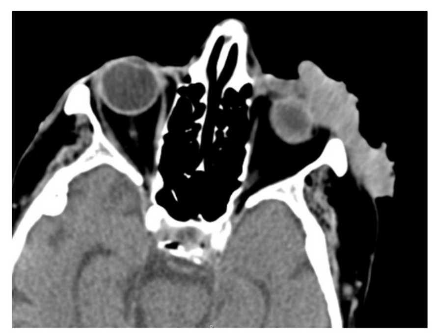
Figure 2: TC showing the extension to the lower eyelid and reaching the bone plane.