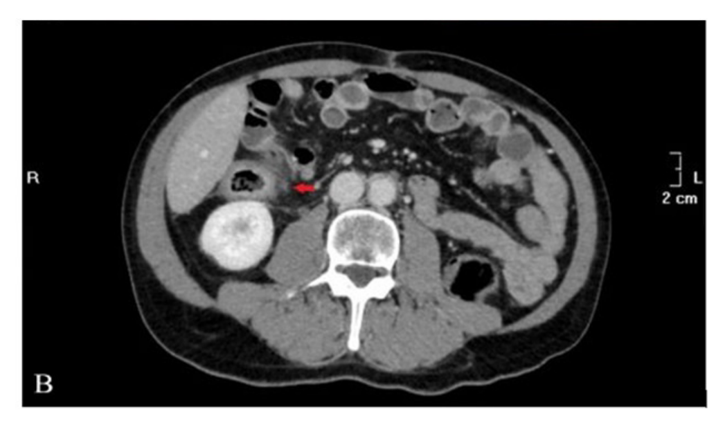
Figure B: chronic active inflammation

Symptomatic colitis is one of the most common side effects associated to ICI therapies. It usually occurs after 6 weeks of treatment. Late (i.e. within 3 months) post-discontinuation ICI-related colitis is not usual and very late post-discontinuation ICI-related colitis are extremely rare [4].