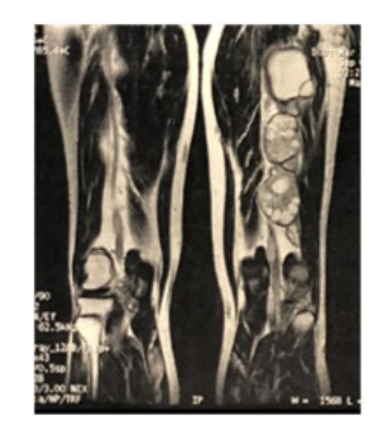
Figure 1: Biological diagnosis of hydatid involvement was strongly suspected on the base of serological examinations (Western Bloot and ELI-SA).

Boussouga M et.al. Sciatic Palsy with Thigh Hydatidosis. J Clin Med Img 2021; V5(6): 1-1.