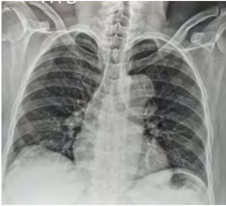
Figure 1: Radiographie du thorax de face Déroulement du bouton aortique