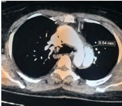
Figure 2: Angioscanner thoracique (Coupe transversale) Solution de continuité d'environ 5.54 mm en regard de l'isthme de l'aorte