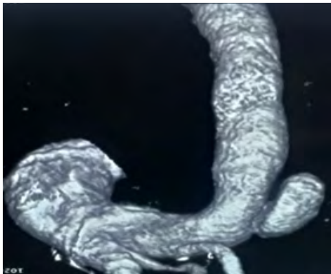
Figure 3: Angioscanner thoracique (Coupe longitudinale) Extravasation du produit de contraste