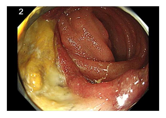
Figure 2: Endoscopic view of the ileum through the fistula.