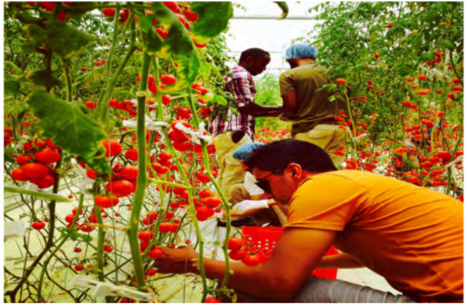
Figure 4: Imec Tomato Farm in UAE.

registered in over 80 countries, we will deploy Imec all over the world. In Japan, we started to recover the farmland contaminated with sludge of tsunami in Great East Japan Earthquake.