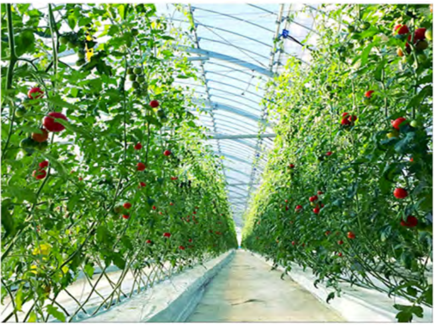
Figure 3: One of Imec Tomato Farms in Japan.

4) Lately, so many companies such as general constructions, ship building and railroad companies and even securities corporations, have entered farming business due to the business stagnation. The companies are apt to adopt more industrialized farming like Imec, compared to the conventional farming.