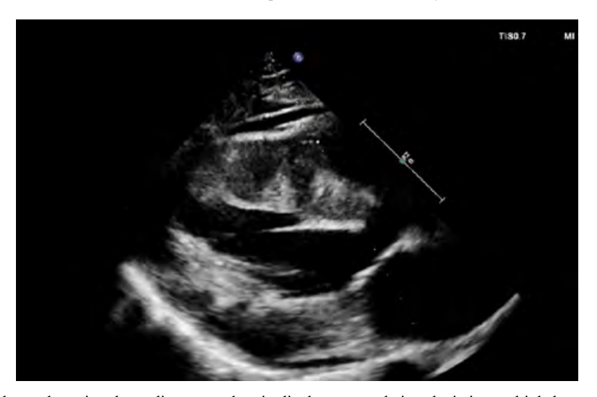
Figure 2: Two-dimensional transthoracic echocardiogram on longitudinal parasternal view depicting multiple hypoechoic nodules in the latero-inferior wall and in the interventricular septum causing an increase in the left ventricular walls thickness.