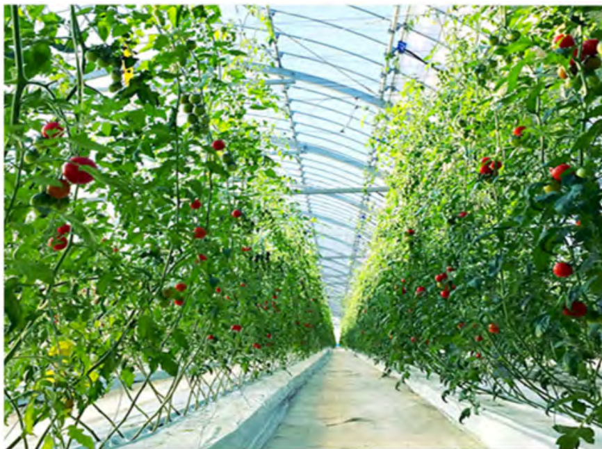
Figure 3: One of Imec Tomato Farms in Japan.

4) Lately, so many companies such as general constructions, ship building and railroad companies and even securities corporations, have entered farming business due to the business stagnation. The companies are apt to adopt more industrialized farming like Imec, compared to the conventional farming.