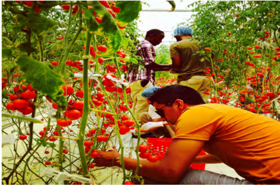
Figure 4: Imec Tomato Farm in UAE.

of Japan by strong sunlight, long daytime and consecutive fine weather. Imec could change the barren desert to the production base of farm products. Using Imec patents that have been applied in 127 countries and already registered in over 80 countries, we will deploy Imec all over the world. In Japan, we started to recover the farmland contaminated with sludge of tsunami in Great East Japan Earthquake.