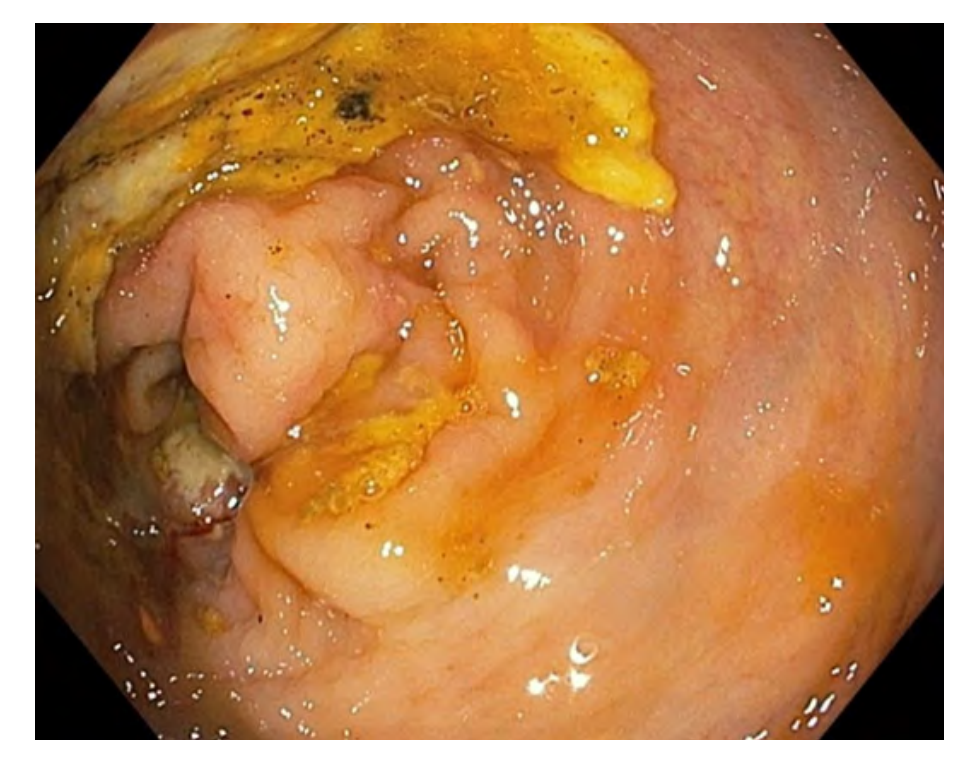
Figure 2: Ulceration approximately 4 to 5 cm in size appearing in a semi-circumferential fashion with stercoral origin.